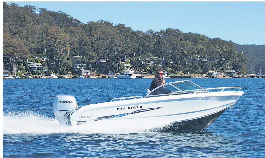
The sleek lines of the Morningstar Bay Rover are very impressive.