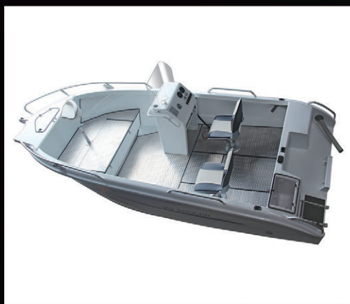
460 Angler Sports Cuddy

Right: As you can see from this shot, there is what could be described as a booster seat for short arses!