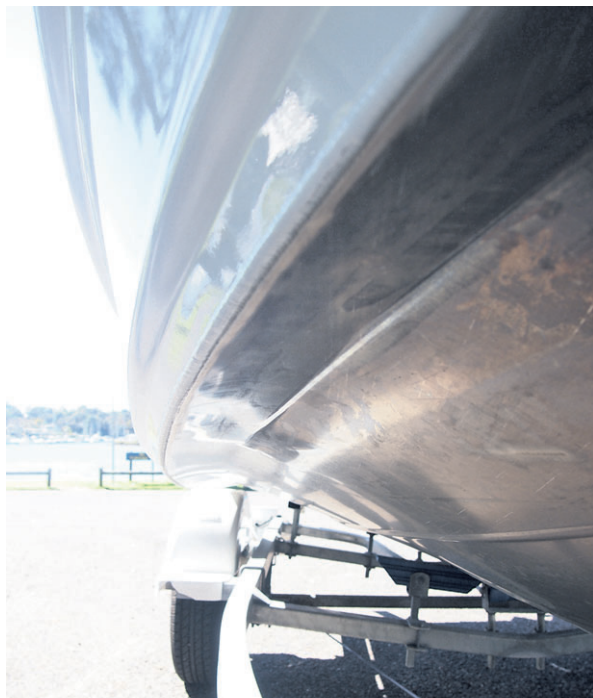
The second chine has been reversed. This, combined with the flared-bow, pushes spray down, giving a stable and dry riding experience.

On closer inspection, I believe that the revolutionary design of the aluminium plate formed hull with a second