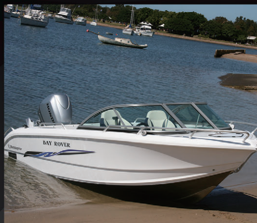
Bay Rover Bay Fisher