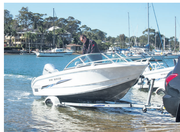
The Bay Rover was very easy to drive up onto the trailer.

What I need is plenty of storage in my boat for all those bait rigs, terminal tackle, lures and soft plastics. The Bay Rover does have